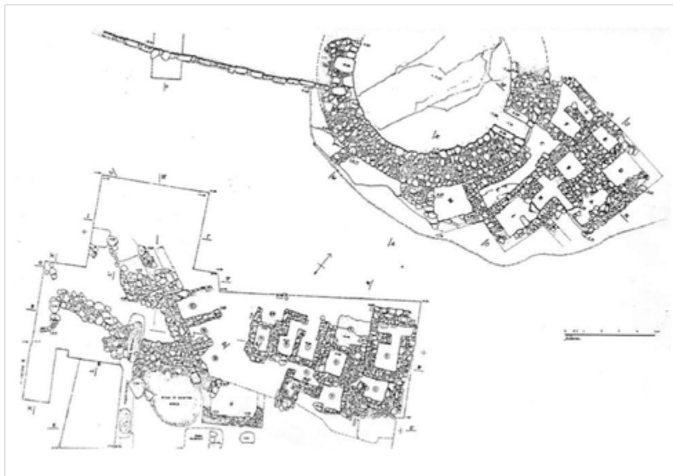
Fig. 2 The area of the Camerette and the Deposit of the Camerette (LA ROSA 2013, 307).