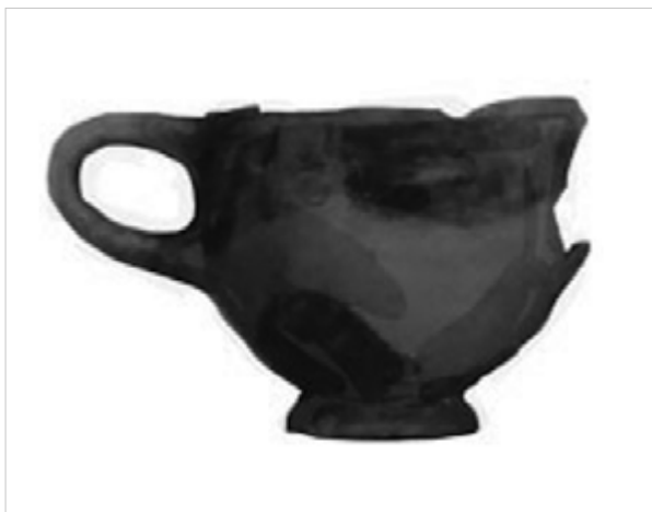
Fig. 3 The Ayia Triada sauceboat (LA ROSA 2013, 217).