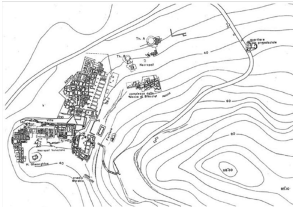
Fig. 1 The Ayia Triada site (TODARO 2003, 9).